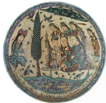
Figure 5: Bowl . 1187. Fritware, 9.2075 cm x 21.2725 cm. Los Angeles County Museum of Art. Public Domain. https://collections.lacma.org/node/228685 .

the craftsman ensured that it does not eclipse the writing. The human figures and birds pointing to the fishpond direct the viewer's gaze toward the poetry shoehorned under it. The Metropolitan Museum bowl is the only one that names the maker: the signature states "Abu Zayd himself made it and composed it" followed by the day, month, and year. 72 Watson read the authorial inscription on the LACMA piece similarly: "Its narrator is the writer." 73 Therefore Abu Zayd authored one (or more) of the poems on each of these bowls—the one written closest to the signature, at the least. Pancaroğlu argues that the uncustomary full date on the Metropolitan Museum bowl likely exemplifies the potter's intention to document the creation of either his poem or the entire object, rather than to merely fill space. 74 Meanwhile, the British Museum bowl was probably signed; on it Watson observed the remains of "wrote it" ( katabahu ). 75 Abu Zayd's identification of his roles in production communicates his skill in not only ceramic making but also in the oral and written aspects of poetry—his pieces' ingenious features. 76 His signature declares his multiple talents employed in the