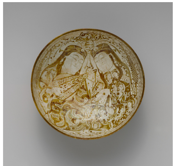
Figure 1: Bowl with Musicians in a Garden. Late 12th-early 13th century. Stonepaste, 8.9 cm (height), 21.3 cm (diameter). The Metropolitan Museum of Art. Public Domain. https://www.metmuseum.org/art/collection/search/451358 .

The text and imagery of a luster-painted bowl in the Metropolitan Museum of Art (Figure 1) exhibit this ambition. In the interior, the sumptuous garden