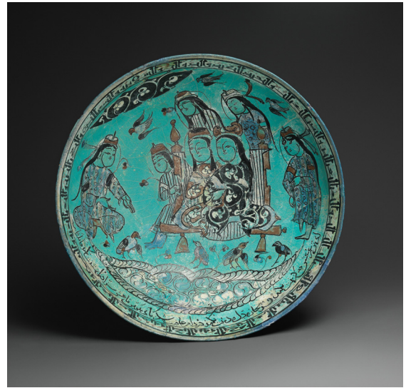
Figure 3: Zayd, Abu. Bowl with a Majlis Scene by a Pond. 1186. Stonepaste, 8.1 cm (height), 21.6 cm (diameter). The Metropolitan Museum of Art. Public Domain. https://www.metmuseum.org/art/collection/search/451752 .

The bowls in the Metropolitan Museum (Figure